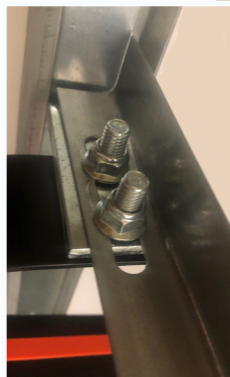
Track Containment System