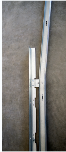
One-piece, curved VL track